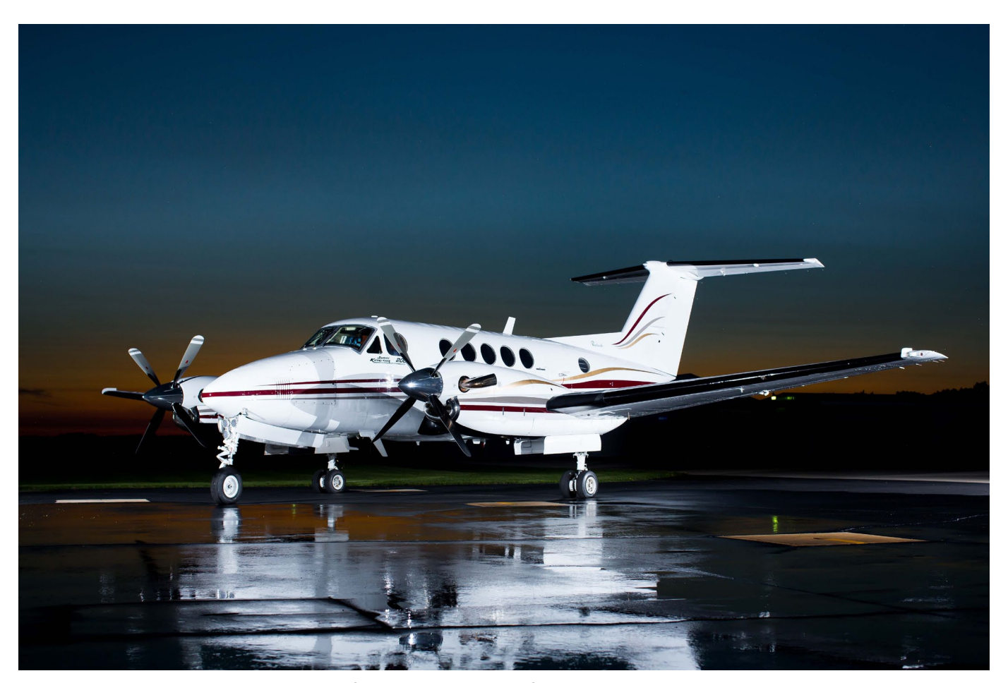
*Specifications subject to verification by purchaser